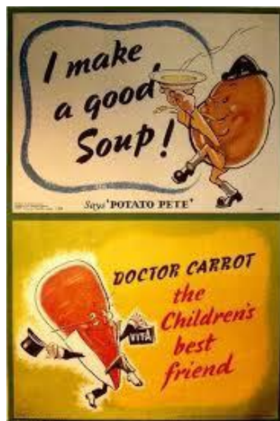
Potato Pete and Dr Carrot

Potato Pete and Dr Carrot were cartoon characters that were created and they produced recipes to make bland meals more appetising.