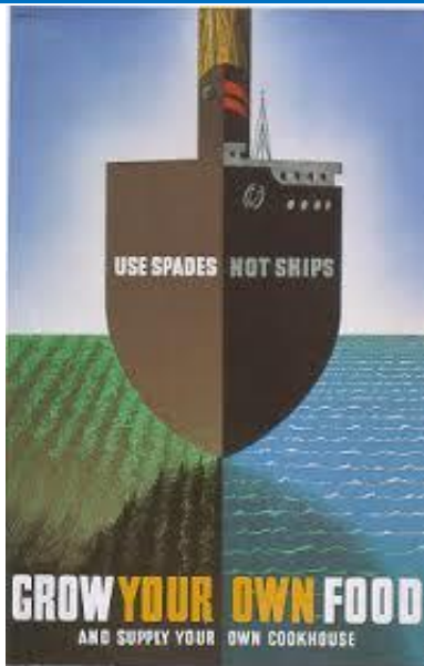
Poster to promote growing food in your own garden

In September 1939 when war broke out most goods were transported to Britain by ship. Britain had always imported food from overseas. From the beginning of the war Hitler used submarines to hit merchant supply ships which were full of goods for Britain. This left Britain threatened with risk of starvation.