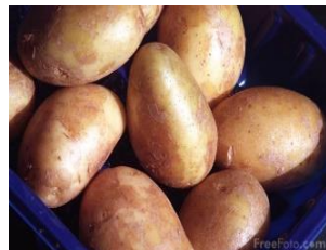
Carrots and potatoes were freely available